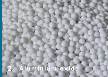
2. Aluminium oxide